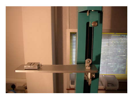
Optional Co-Efficient of Friction Attachment BSI/ASTM/DIN Test Methods

Unit 39 Gold Business Park, Jenkins Drive, ELSENHAM, Herts., CM22 6JX ENGLAND. Tel: +44(0)1279 817171 Fax: +44(0)1279 815743 E-mail: sales@rdmtest.com Web: www.rdmtest.com